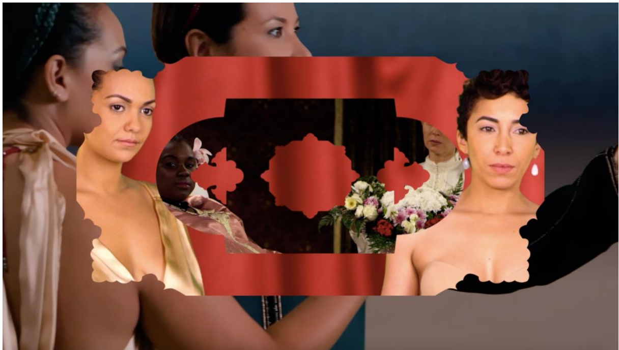
Zoulikha Bouabdellah, Envers-Endroit , 2016

Still, 2 Channel Video, 6 mn, color & sound