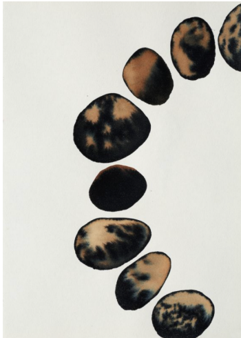
Fakhri El Ghezal Astres perdus 10 Eau de javel et encre sur papier 29,5x21cm, 2023

In the Tunisian dialect, to "open the colour" means to dilute it through various nuances until it disappears. El Ghezal's exploration of this chemical process interests him for its ability to reveal diverse colour nuances without losing substance. This intricate play with colour and light in his circumscribed forms reflects a deeper search for openings within enclosed spaces.